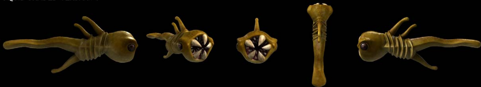
SQUID SHADED VERSION 1