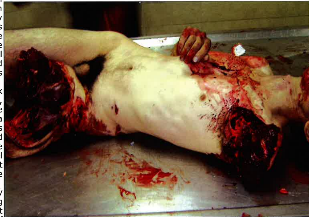
Drunk Pedestrian Killed by Subway- Body on Autopsy Table

error, where social experiments frequently go wrong. Today, those symptoms of techno-industrial fare seem ever more present, and by the year 2025 nearly two-thirds of the world's population will be living in urban environments. But if those before Kaczynski ever saw the hazard of the new times, they certainly