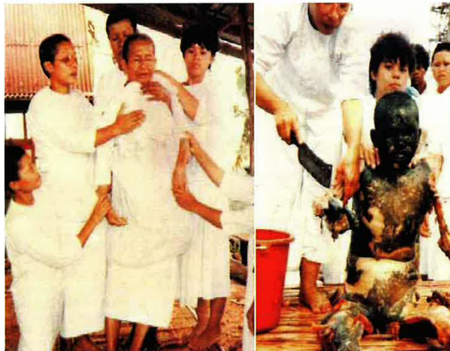
Deceased Nun Eaten By Fellow Nuns During Religious Ritual