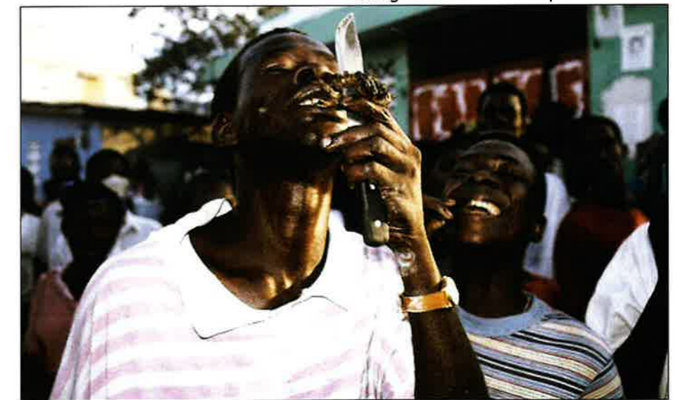
Pieces of the burned body of the Tonton Macoute eaten.

While Taylor denied dining on higher life forms and the old chief bragged, rebel fighters in the Congo continue to sit back, munch away and let the cameras roll. The U.N. does have forces in the area, but apparently their mandate doesn't include interfering in quaint local customs, such