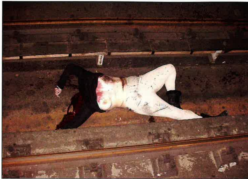
Decapitated After Jumping under Subway Train