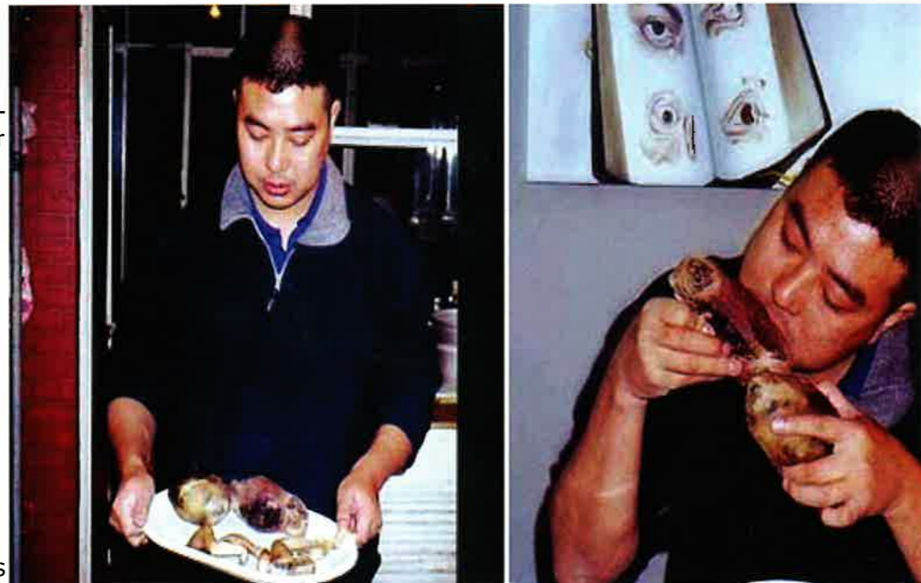
Fake Cannibalism Image, part of Shanghai art exhibit. Baby constructed by placing a dolls head on a duck's carcass