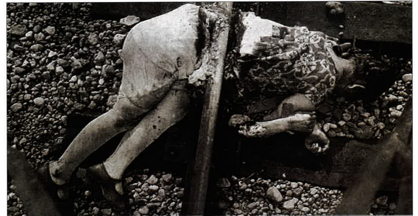
Another Subway Suicide, 1950's

These days, crimes in the subway give cause to a lot of passed-around blame. But it's hard to blame what can't be stopped when people are scrambling for their lives. The sum of its munitions is, after all, what we created. I think of that when I hear of a subway blast in northeast Moscow, or a fire started by a man in Daegu, South Korea, or the midnight rape of an Asian woman down the long passageway of the Canal Street station in New York. Trains don't think. Nor do they murder when you're lucky enough to avoid them.