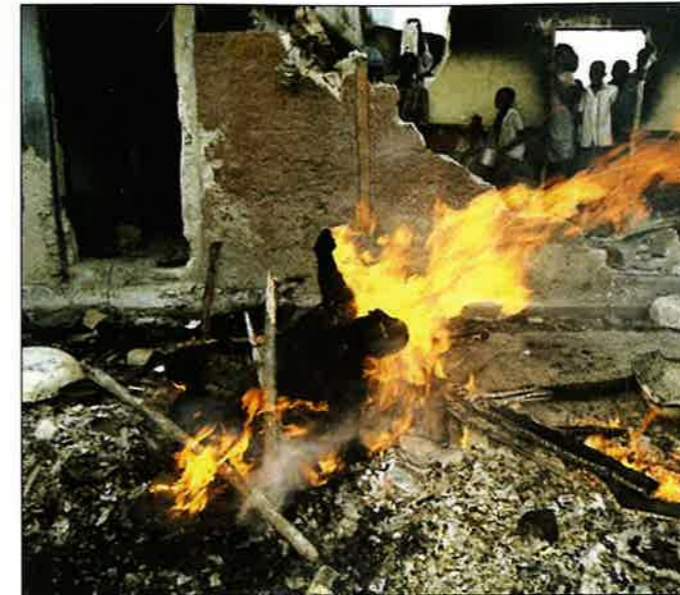
Haitian men cut and prepare to eat pieces of flesh from charred body of a Tonton Macoute- a member of a private Haitian death squad- that they have just burned in a public square. (preparation shown here)

In present day Liberia, fear is the motivating factor. Explaining a gruesome pile of skulls to a western